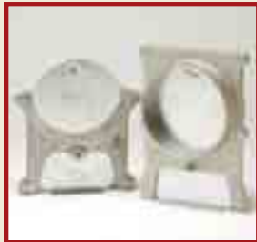
Blast Gates (Pages 31-32)