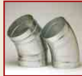
Elbows (Pages 5-6)