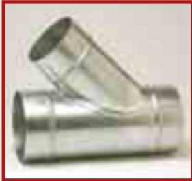
Laterals (Pages 12-14)

Spiral Manufacturing has all the duct components you need to design and build a safe and efficient dust collection system