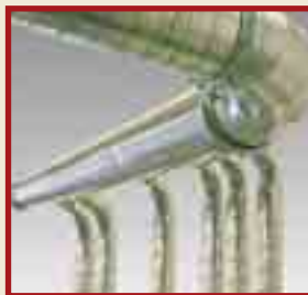
Manifolds (Page 14)