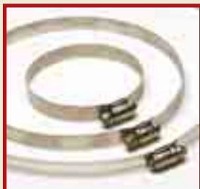
Clamps (Page 34)