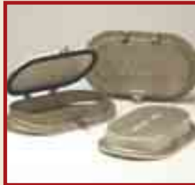
Clean-outs (Page 30)