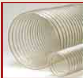
Clear Flex Hose (Page 33)