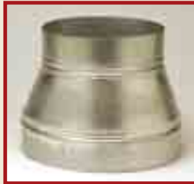
Reducers (Page 15)