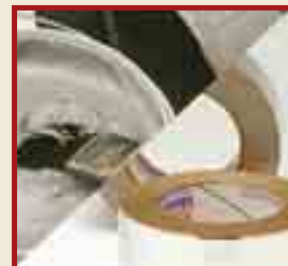
Duct Sealants (Page 27)