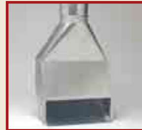
Floor Sweeps (Page 17)