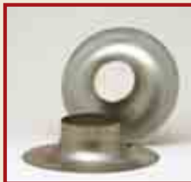
Bellmouth (Page 17)