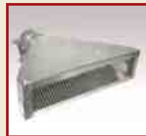
Custom Hoods (Page 19)